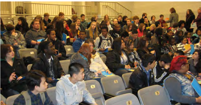
High School students attending RooMath 2012 Recruitment

Friday February 10, 2012: The first "RooMath 2012" Recruitment Event took place in Royall Hall. About 100 students from Kearney High School, Southwest Early College Campus, and Winnetonka High School attended. Events included five presentations on Careers in Statistics, Careers in Mathematics or Applied Mathematics, Cryptography, The Monty Hall Problem, and a Mini Math Video Fest, followed by pizza in Royall Hall Room 111; a great day for our department.